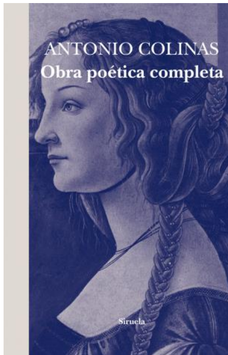
72 (Figure 2)

The imagery and subject matter of the poem “Simonetta Vespucci” are also recreated in the cover art of Colinas’s Obra poética completa (2011), 70 which displays part of a profile portrait of the historical Simonetta (c. 1453-1476) by Botticelli. 71 This image also echoes an image in the poem “Sepulcro en Tarquinia” and other similar poetic and visual representations of this same figure: “aquella virgen / de Botticelli con tu rostro” (171):